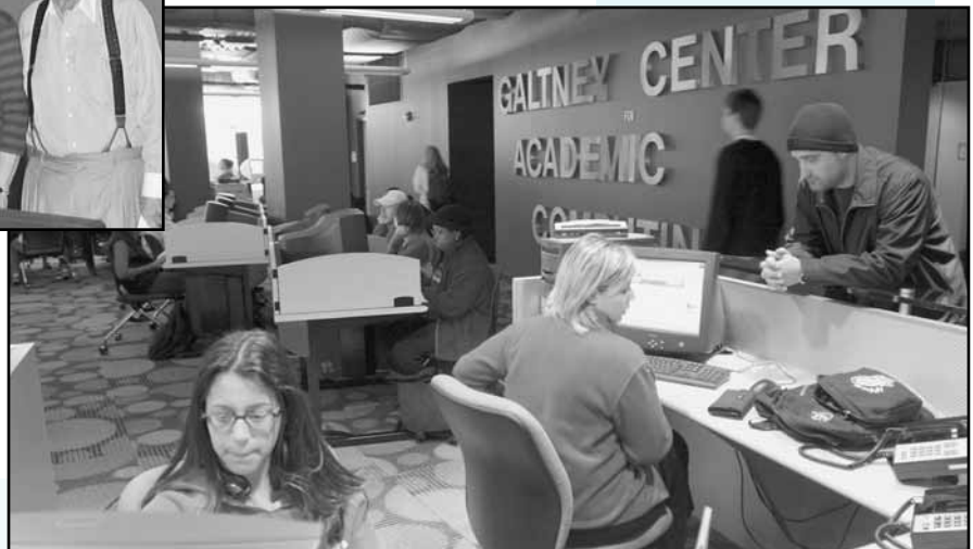
The main computer lab averaged 14,000 student visits per month last fall.

The main destination for students, though, is the first floor's spacious computer lab, which has 70 computers (58 PCs and 12 Macs), a scanner, color and standard printers, and a copy machine.